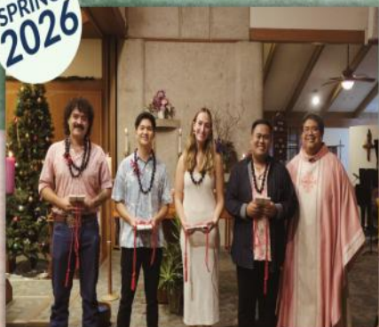
NEWMAN CENTER HOLY SPIRIT PARISH CAMPUS MINISTRY